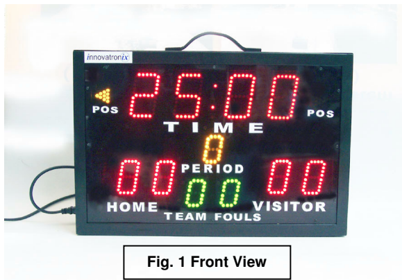
Fig. 1 Front View